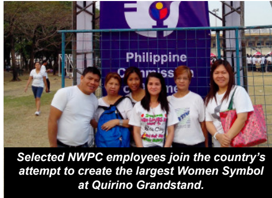
Selected NWPC employees join the country's attempt to create the largest Women Symbol at Quirino Grandstand.

Presidential Proclamation No. 224 (series of 2008) declaring the first week of March as Women's Week and Presidential Proclamation No. 227 (series of 2008) on the observance of the month of March as Women's Role in History Month.